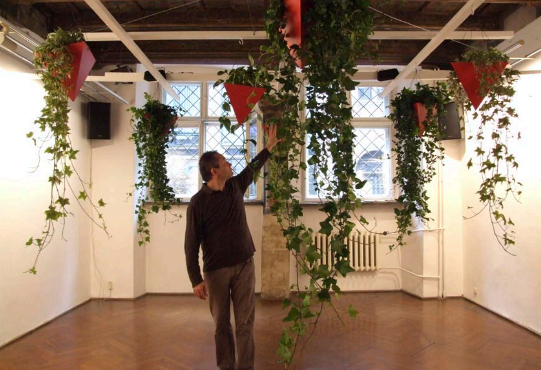
WRO 09 - 13th Media Art Biennale / Entropia Gallery - Wroclaw (Poland)