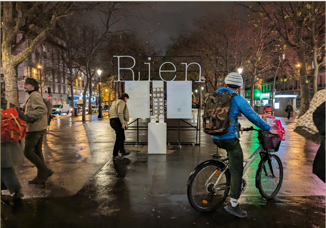
Paris, dec 2023 / MAIF Social Club et Néo - biennale internationale des arts numériques produite par le Centquatre-Paris.